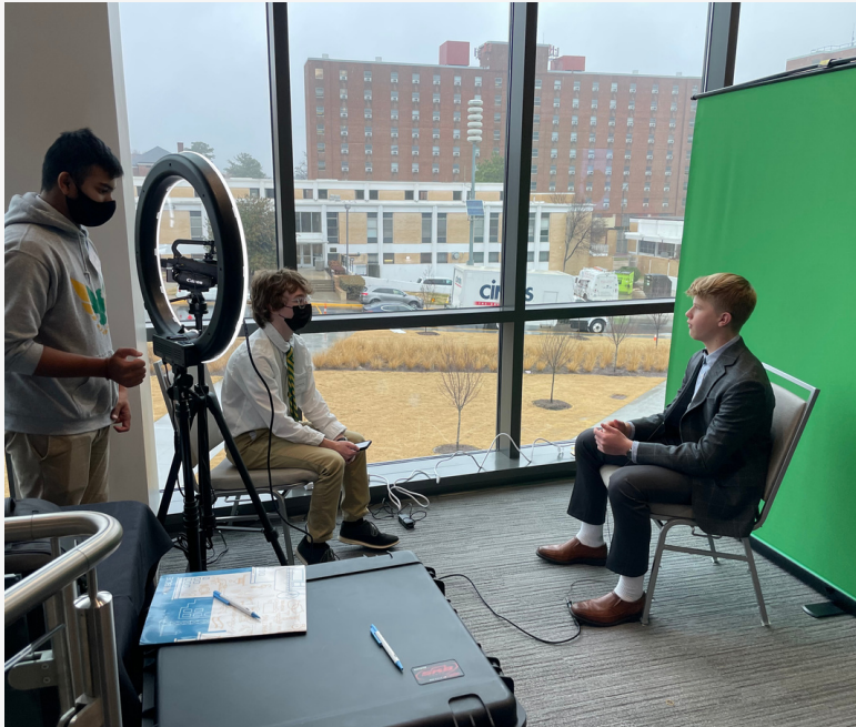
Wake Young Men's Leadership Academy