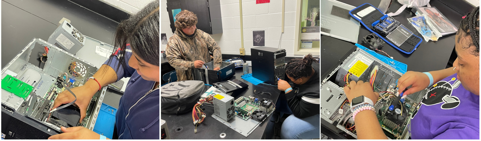
Halifax students in action