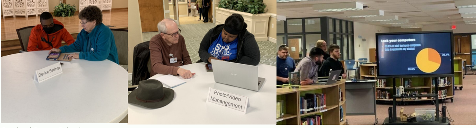
Scotland County Schools